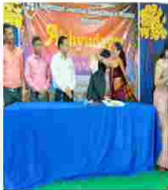
Light lamping and Felicitation of guest of programme