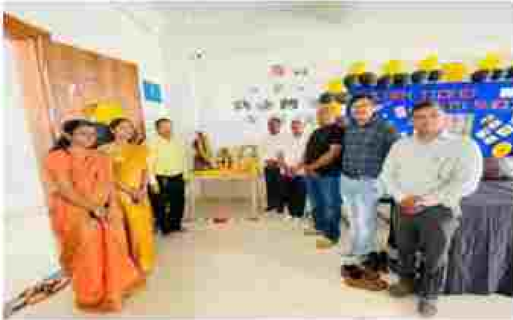
Lamp Lighting, Saraswati puja was done on the occasion of teachers day by Guest