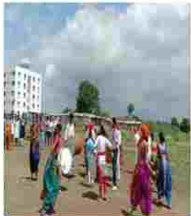
Stapna of Ganesh Idol in RJS foundation with Lezzim and Dhol for Ganesh Chaturthi.