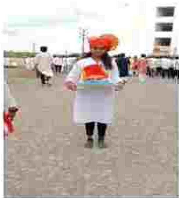
Ganesh Idol making competition in RJS college of Pharmacy, Kokamthan