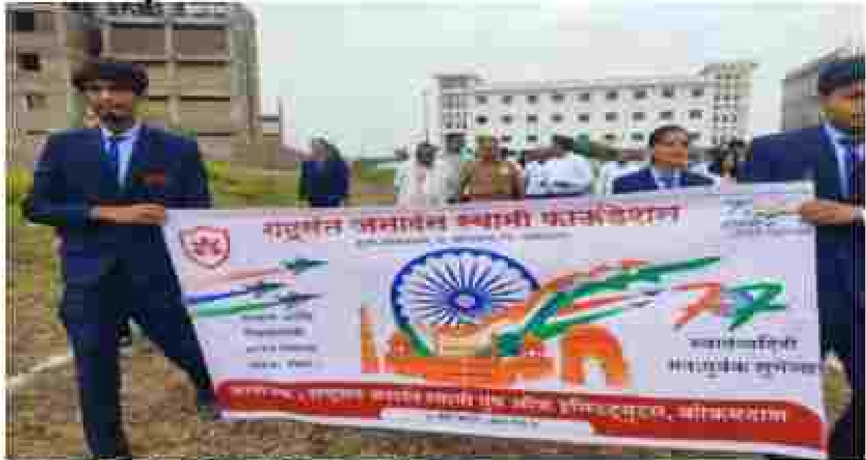
Independence Day Rally of RJS group of institute :