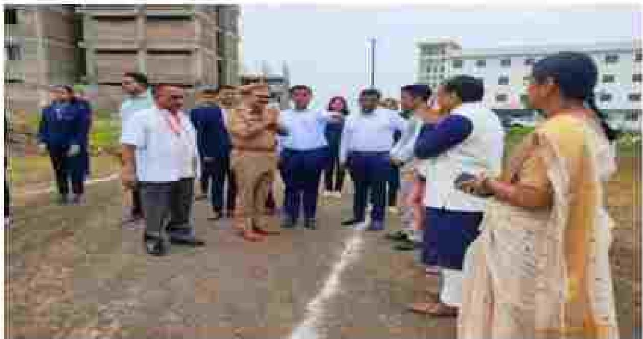
Guest Welcome by RJS Group of Institute