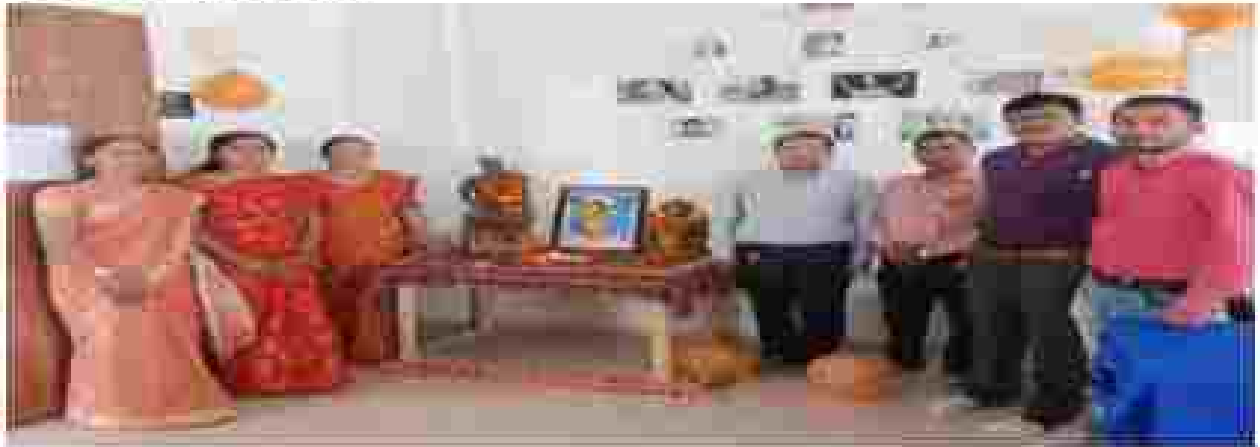
Lamp Lighting, Sarasvati puja and Chhatrapati Shivaji Maharaj arti was done on the occasion of Shiv Rajyabhishek divas by Guest.