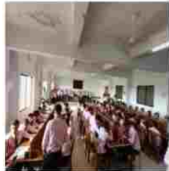
Library staff giving books to students on occasion and students seating for Quiz competition.