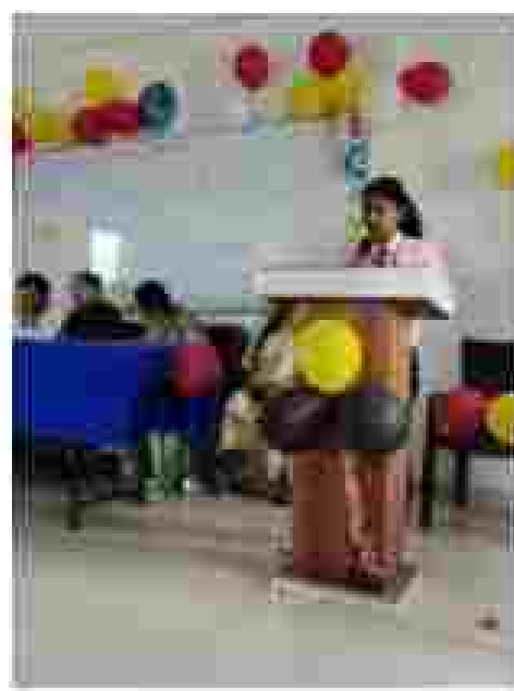
Felicitation of teaching and non-teaching staff from students by giving a gifts and giving speech on the importance of gurus in their life at RJS college of Pharmacy, Kokamthan.

Guru Purnima, also known as Vyasa Purnima is observed in Hinduism to commemorate the birth of Ved Vyasa, a well-known sage who is said to have divided the Vedas into four parts by editing them; he likewise composed the Puranas which is viewed as the 'fifth Veda' and the Mahabharata. It is accepted that on this day, prayers arrive at the Mahaguru directly and his blessings eliminate darkness and ignorance from a disciple's life. Pupils worship their spiritual Gurus (Teachers or Gods) on this day for imparting their knowledge for living a happy life. Guru Purnima is observed by people of many religions, including Hindus, Buddhists, and Jains, across the country since Gurus and teachers are significant to everyone.