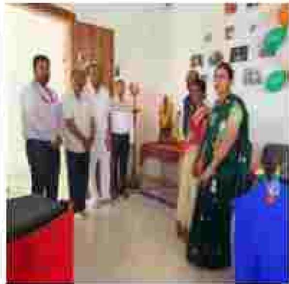
Light Lamping and Saraswati puja by guest of "Meri Mitti Mera Desh" Program